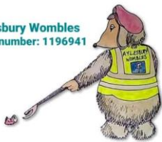
Supporting the Aylesbury Wombles

Aylesbury Wombles charity number: 1196941