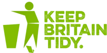
Exploring ways to reduce waste